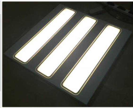
Panel Fixture is also available as LED Grille Light, in various wattages.